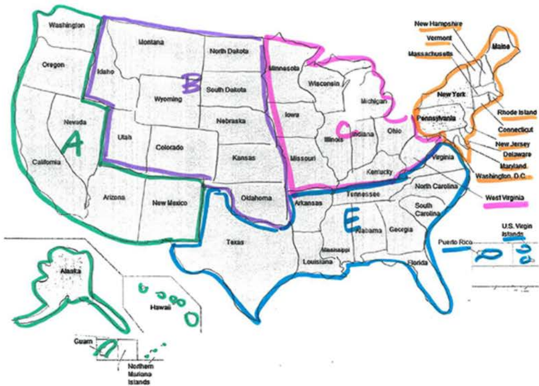
Five Regions - Option 2

This option moves West Virginia, Virginia, Idaho, Colorado, and Utah from their current regions and merges the remaining jurisdictions in region 2 with region 1.