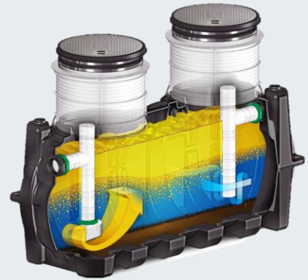
Example of a single compartment grease interceptor for exterior applications

Use the Public Look-Up to view all other approvals of plumbing, private onsite wastewater treatment systems, and pool products.