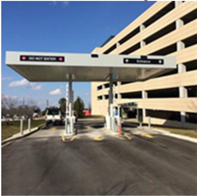
Picture: Hill Farms Parking Structure 1 st Floor