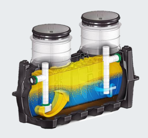
Example of a single compartment grease interceptor for exterior applications

Use the <u>Public Look-Up</u> to view all other approvals of plumbing, private onsite wastewater treatment systems, and pool products.