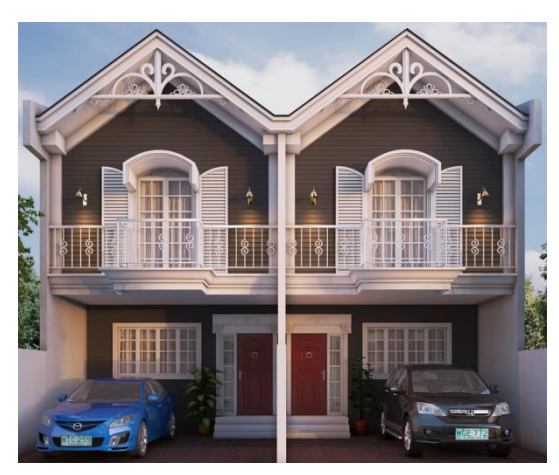
SPS 327 v. SPS 324

SPS 327 Electrical Standards closely mimics SPS 324.