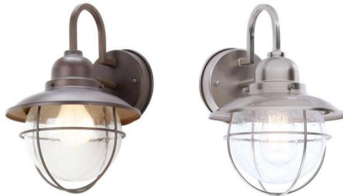
SPS 327 v. SPS 324

SPS 327 electric standards mimic SPS 324 with three additional subsections added.