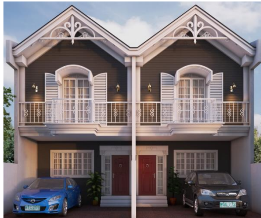
SPS 327 v. SPS 324

SPS 327 Electrical Standards closely mimics SPS 324.